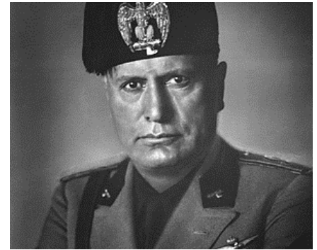
From 1926-1943, Benito Mussolini ruled Italy as a dictator with total control of the government.

Sometimes you might hear people talking as if government is an evil monster. Are they overreacting? Are there reasons to fear government? Whose side is government on, anyway? Throughout history, there have been governments that had too much power and ended up abusing that power. They limited people's freedom, mistreated people, and even committed mass murders. In some places, that still happens today. Government isn't evil—but the people who run governments do need to be kept in check so they can't abuse their power. There are several ways to limit government power.