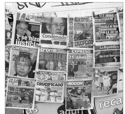
Peruvian newspapers announce Fujimori's 25-year prison sentence for human rights abuses

Fujimori went to Japan to hide from the scandal. The scandal allowed Fujimori's opposition to gain control, and government in Peru was restored. Later, Fujimori was sentenced to six years in prison for abusing his power and 25 years for human rights abuses in Peru.