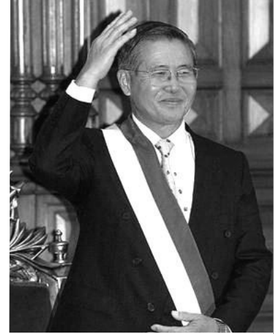
Fujimori after his election in 1990

Alberto Fujimori was born in Peru after his parents emigrated from Japan. When Peruvians elected him to be their president in 1990, he was very popular. Peru had huge financial problems, and Fujimori had ideas for making Peru more prosperous. He also had ideas for dealing with a group of terrorists that had been causing problems in the country. But Peru's Congress was filled with lawmakers who opposed Fujimori, and they refused to pass any of his ideas into law.