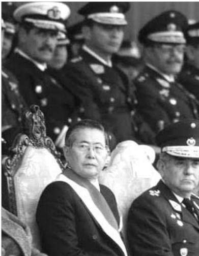
Fujimori with some of his military and government leaders

And then Fujimori set his sights on Peru's constitution. He issued a decree, or presidential order, saying the constitution could be ignored. His decree also got rid of Congress and gave the president the power to make all the laws. Fujimori then fired almost half of Peru's 23 Supreme Court justices, as well as many other judges around Peru who believed his actions were unconstitutional.